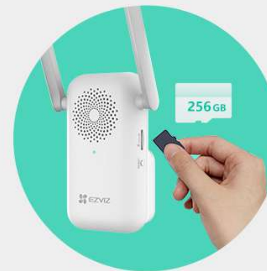
Supports MicroSD Cards

The chime is equipped with a 256 GB MicroSD card slot, allowing you to record more of those special moments. This anti-theft design improves data security compared with conventional doorbells with a slot. You can also save your images to the EZVIZ Cloud for additional back-up.