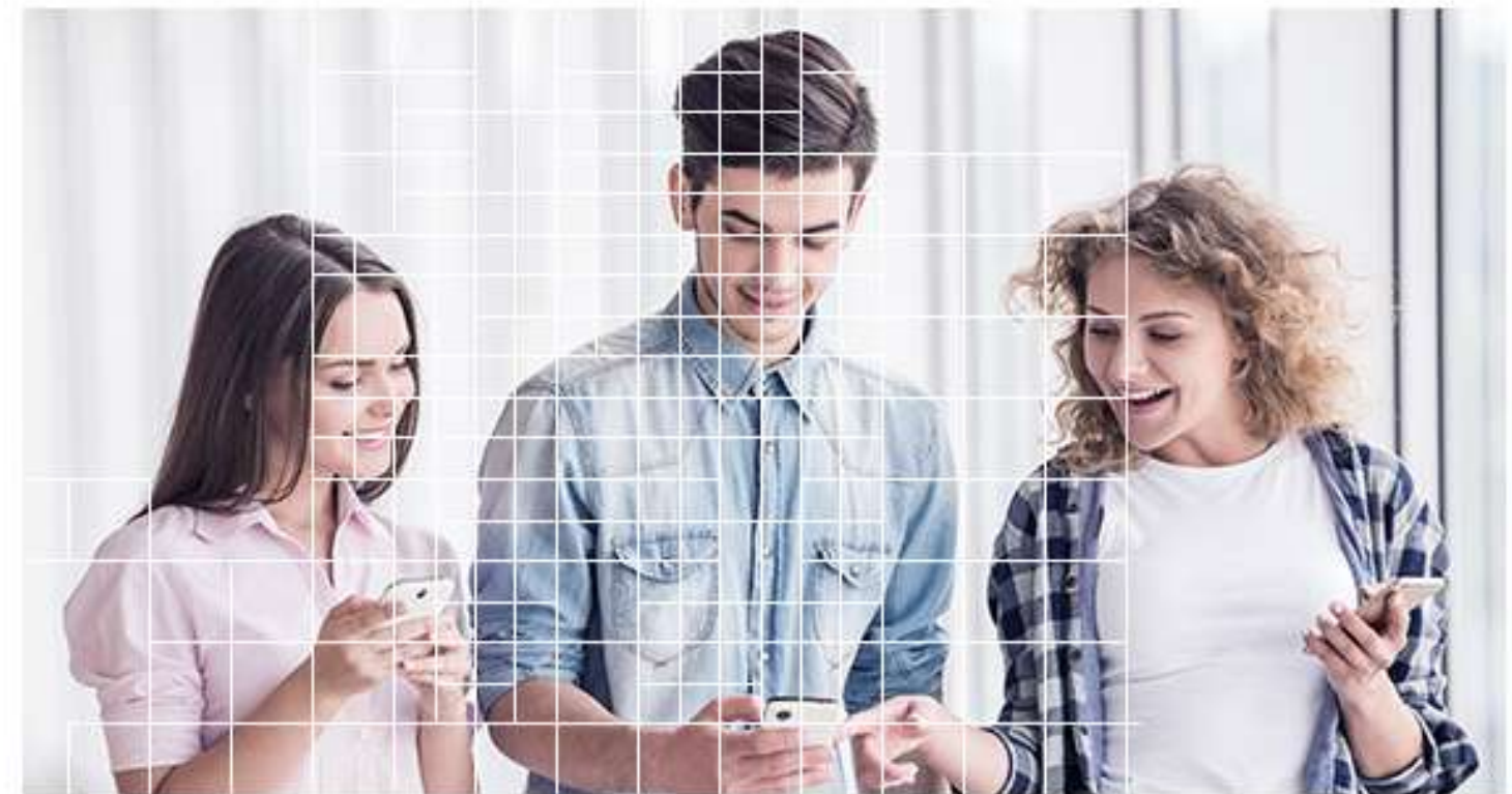
H.265 (Upgraded Video Compression)