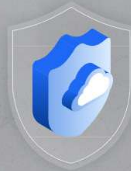
TLS encryption protocol