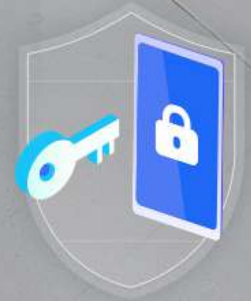
Multiple authentication steps