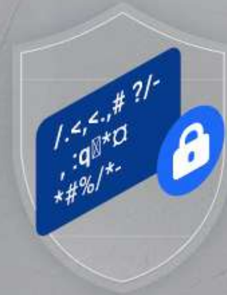
AES 128-bit encryption

Protecting your data and privacy is our highest priority. Data transmission between the device and the EZVIZ Cloud is encrypted from end to end. Only you have the keys to decrypt your data.