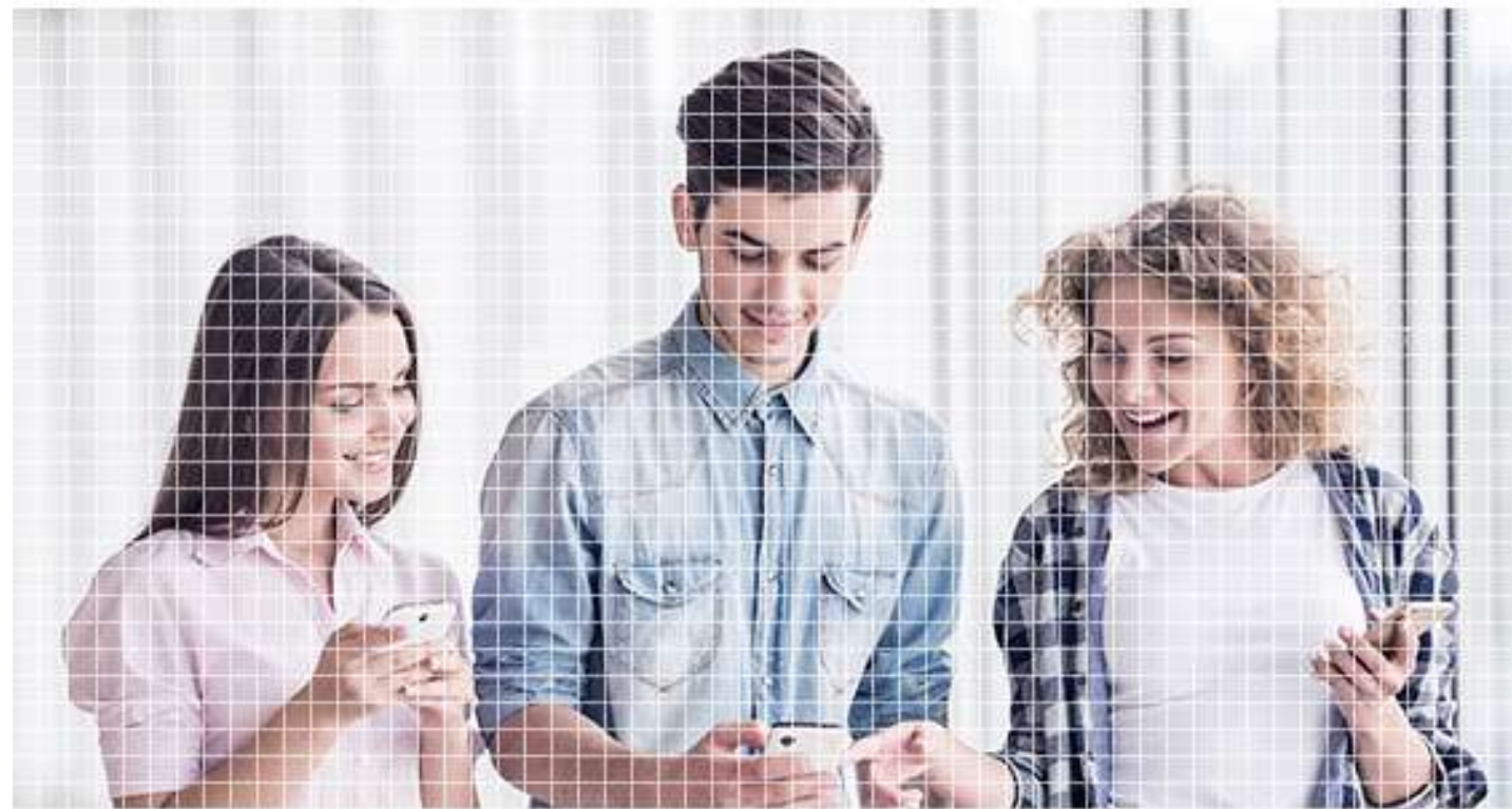
H.264 (Mainstream Video Compression)

The DB2C doorbell features the advanced H.265 video compression technology, achieving better video quality with only half the bandwidth and half the storage space of the previous video compression standard (H.264).